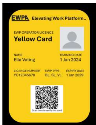
Digital Yellow Card Licence

Additionally, to provide clarity for operators and site supervisors, the EWPA has registered a trademark for 'Yellow Card'. This legal protection will resolve any misunderstanding from operators and site supervisors as to who delivered the training and ensure that operators and sites can easily see that the Yellow Card Operator Licence has been issued by the EWPA.